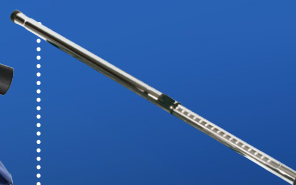
Adjustable telescopic wand extends to suit your height.