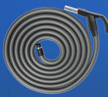
9m, 10.5m & 12m Switch Hose with a convenient switching from the handle.