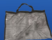
Tidy it all away in a Tool Caddy bag.