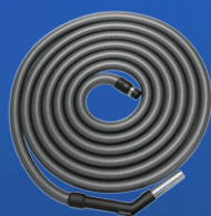
Standard Silver Hose available in 9m, 10m, 12m.

iCentral's key management has a wealth of knowledge and experience in the Central Vacuum and Home Intercom business, so you know you're in safe hands.